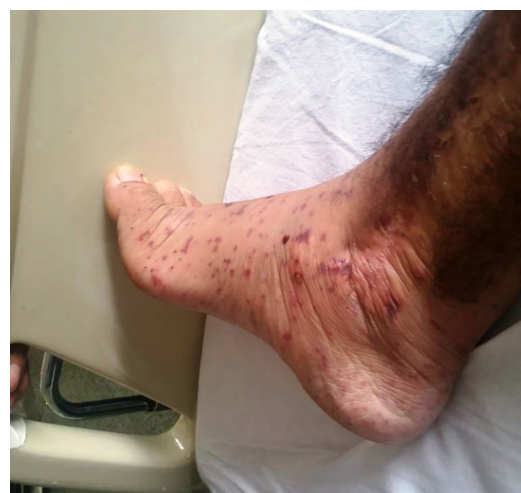
Figure 3 - Lower limb edema in a 26-year-old man victim of multiple honeybee stings in Macapá, Amapá, Brazil

Prognosis is usually good in patients who survive, and full renal function recovery occurs in most cases, and the