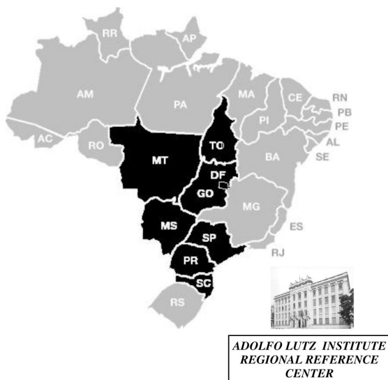
Fig. 1 - The States highlighted in black collected stool samples from patients with acute gastroenteritis and sent them to the Enteric Diseases Laboratory of the Adolfo Lutz Institute, regional reference center for rotavirus surveillance, member of Acute Diarrhea Disease Monitoring Program and its national scope. Abbreviations represent the names of Brazilian States: Acre (AC), Alagoas (AL), Amapa (AP), Amazonas (AM), Bahia (BA), Ceara (CE), Distrito Federal (DF), Espirito Santo (ES), Goias (GO), Maranhao (MA), Mato Grosso (MT), Mato Grosso do Sul (MS), Minas Gerais (MG), Para (PA), Paraiba (PB), Parana (PR), Pernambuco (PE), Piaui (PI), Rio de Janeiro (RJ), Rio Grande do Norte (RN), Rio Grande do Sul (RS), Rondonia (RO), Roraima (RR), Santa Catarina (SC), Sao Paulo (SP), Sergipe (SE), and Tocantins (TO).

This is a retrospective and descriptive study conducted with clinical samples. Stool samples from patients with acute gastroenteritis were sent to the Enteric Diseases Laboratory of the Adolfo Lutz Institute, a regional reference center for RV surveillance, credentialed by the Health Ministry of Brazil, and a member of the Acute Diarrhea Disease Monitoring Program from the State Department of Health. The aim of this program is the early detection of diarrhea outbreaks with national scope. In this study, clinical samples from Sao Paulo (SP), Mato Grosso (MT), Mato Grosso do Sul (MS), Parana (PR), Tocantins (TO), Goias (GO), Santa Catarina (SC) States, and Federal District (DF) were analyzed (Fig. 1).