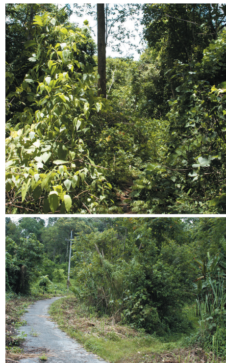
Fig. 2 - General topography of the blow fly collections in Northern Thailand. Upper display of site C in Fig. 1 (Doi Khun Tarn, Mae Ta, Lampang) at 451-600 m; with lower display of site F in Fig. 1 (Doi Nang Kaew, Doi Saket, Chiang Mai) at 901-1,050 m.

from external morphology using the key of KURAHASHI et al. 7 and the aid of a binocular microscope.