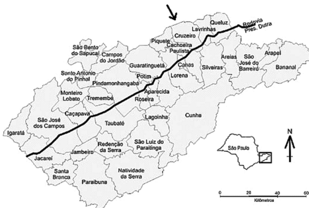
Fig. 1 - Municipalities of Paraíba Valley, 2006.

In this equation we have n corresponding to the number of areas (sectors), w_{(i,j)} is equal to the relevance of the neighborhood, X_{(i)} represents the square root of the average incidence rate for municipality i in the studied periods and \bar{x} refers to the mean of X_{(i)} for the entire studied region.