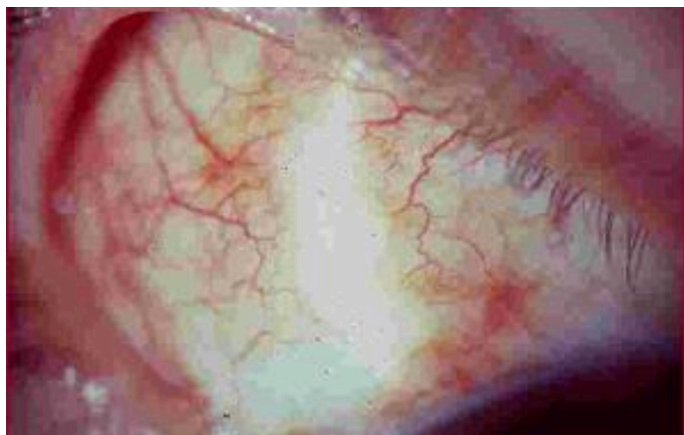
Fig. 1 - Cyst in the bulbar conjunctiva of the right eye.