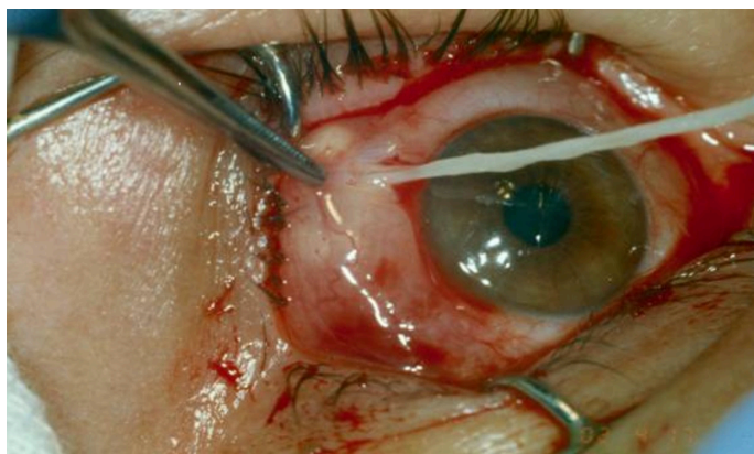
Fig. 2 - Surgical removal of the nodular mass, and appearance of an inert, whitish, flat structure.