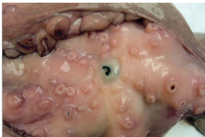
Fig. 2 - The chitinous beak of the octopus is medially located in the body of the mollusk.