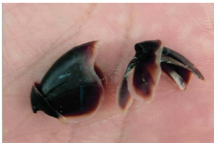
Fig. 3 - Details of an octopus's beak. This structure is capable of breaking the hard shells of mollusks and crustaceans, lacerating soft tissues, and can be linked to venom glands with neurotoxic effects.