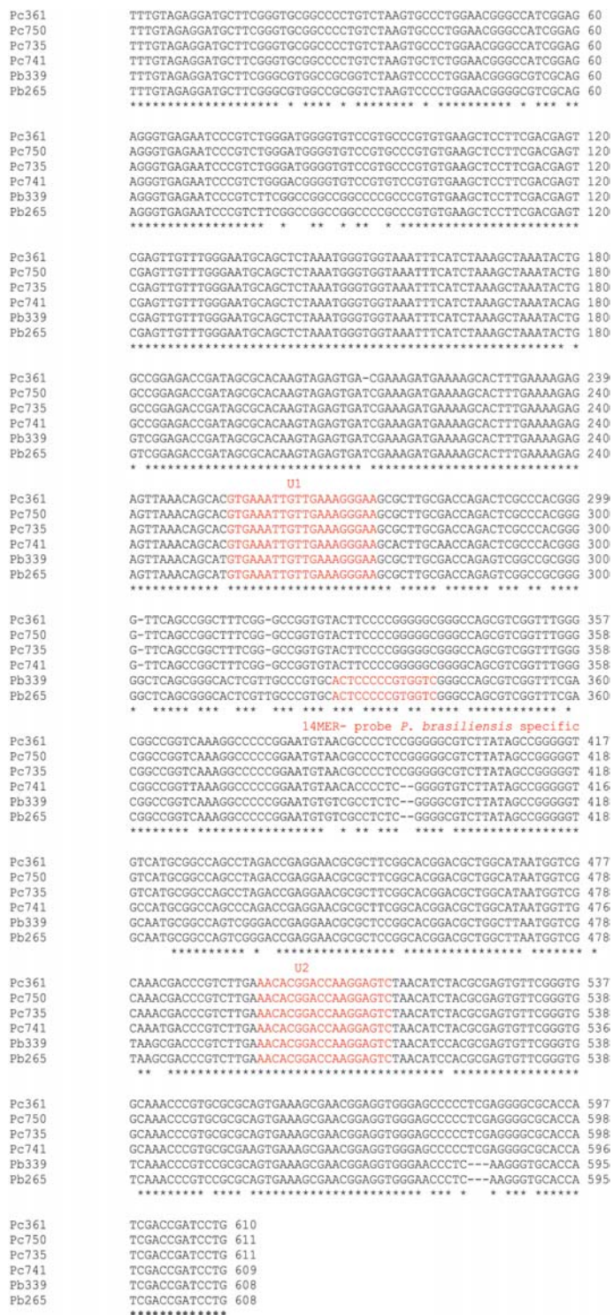
Fig. 4 - Alignment of 28S rDNA sequences of P. cerebriiformis and P. brasiliensis strains as explained in material and methods. * indicates that all strains are identical at that nucleotide position; - indicates that insertions exist in one or more strains, leading the software (Clustal W) to break one or more sequences in order to preserve the best possible alignment. U1/U2 indicates the nucleotide position of internal primers useful for fungal identification 13 and a probe used for P. brasiliensis identification on slot blot hybridization 12 .

as SANDHU, so it is obvious that a blast search would pick up these entries with the highest homology score. However it must be emphasized that we did sequence other two P. cerebriiformis isolates (#735 and #361), with identical results, and blast search retrieved not only SANDHU's entries but also many other from Aspergillus genus. The scores obtained when analyzing our four P. cerebriiformis entries do not allow the conclusion that these isolates are closer to Aspergillus penicillioides than other Aspergillus species, namely conicus and gracilis , since they are all very close.