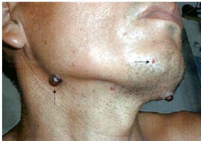
Fig. 2 - Miliary (left arrow) and mulaire (right arrow) lesions.

Hematologic studies showed moderate anemia with a hematocrit of 34% and RBCs count of 5,700 cells/mm 3 . Serologic studies for human immunodeficiency virus and Treponema pallidum were negative. Biopsy of two lesions was performed. Microscopy study showed marked vascular proliferation with prominent endothelium and stromal angiosarcomal cells, arranged in nodules. In the interstitium was visualized the presence of mature lymphocytic inflammatory cells and evidence of ischemic necrosis with hemorrhage and dense infiltration of mixed inflammatory cells, lymphocytes and polymorphonuclear cells, without cellular typing (Fig. 3). They were identified as the mulaire and the nodular or subdermal types of the eruptive phase of the Carrion's disease. Once the diagnosis was determined, the lesions were quantified and classified, and a total of 191 were identified. The majority were warts of the miliary type (58.6%),