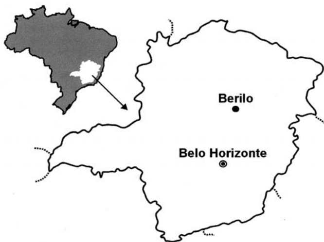
Fig. 1 - Location of Berilo, in Minas Gerais State, Brazil.

areas, a systematic selection was made of one from every six inhabited houses. In the rural area, the population was divided into nine sectors and the sample was proportionally distributed between these sectors. Based on ease of access, we selected two or three communities from each sector, and eventually studied 23 communities from different regions of the municipality. Whenever access was feasible all the houses in these communities were included in the study. All inhabitants aged over six months living in the selected houses were examined; those children that were at school during the home visit, were examined at a later opportunity.