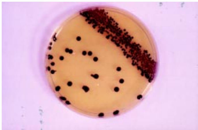
Fig. 1 - Violaceous colonies of Chromobacterium violaceum in Müeller-Hinton agar.

to ampicillin, cephalothin, cefoxitin, ceftriaxone, cefotaxime and ceftazidime.