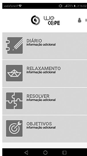
Figure 1. weCOPE main menu.

A multidisciplinary team composed by engineers and mental health professionals was assembled to design the weCope prototype, considering users and professionals' perspectives. Additionally, services users were consulted throughout the development process. The weCope app includes four modules (Figure 1): symptom monitoring, problem-solving, anxiety management and goal setting, allowing also the contact with therapists in crisis situations.