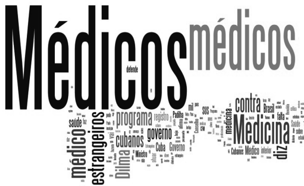
Figure 4 Tree of most mentioned words in news headlines.

Figure 4 reflects the most mentioned words in the headline news from Folha de São Paulo and Correio. The words represent larger ones that appeared most frequently in this way may be noted that the term most often cited was “Doctor” because of the theme and choice of descriptors for the news. The titles were more related to problems of corporate conflicts between Brazilian and foreign doctors. We notice that the word “against” assists in finding that most publications is negative slant.