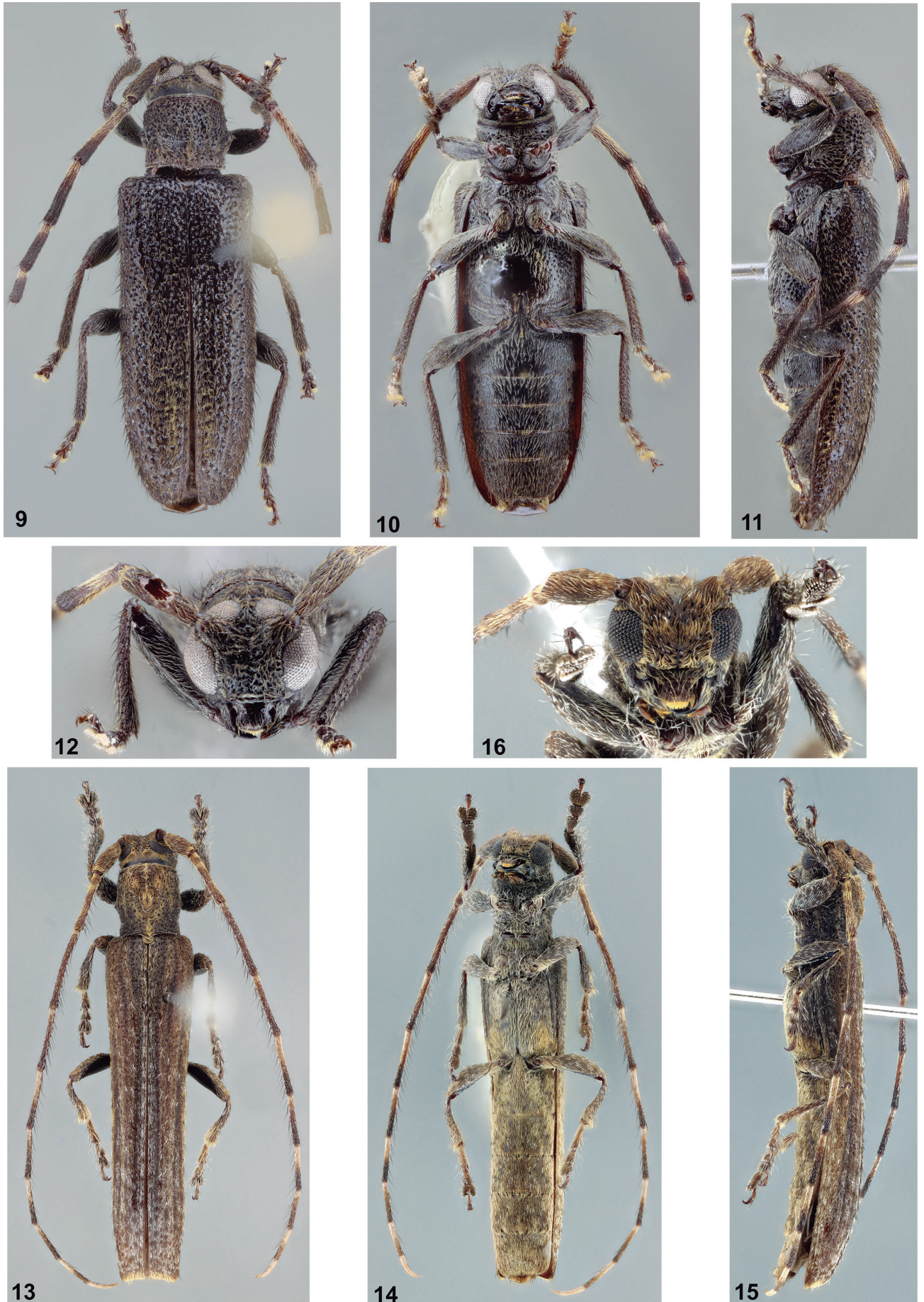
Figures 9-16. (9-12) Nappella antonkozlovi , holotype male: (9) Dorsal habitus; (10) Ventral habitus; (11) Lateral habitus; (12) Head, frontal view. (13-16) Epectasis mexicana , male from Colombia: (13) Dorsal habitus; (14) Ventral habitus; (15) Lateral habitus; (16) Head, frontal view.