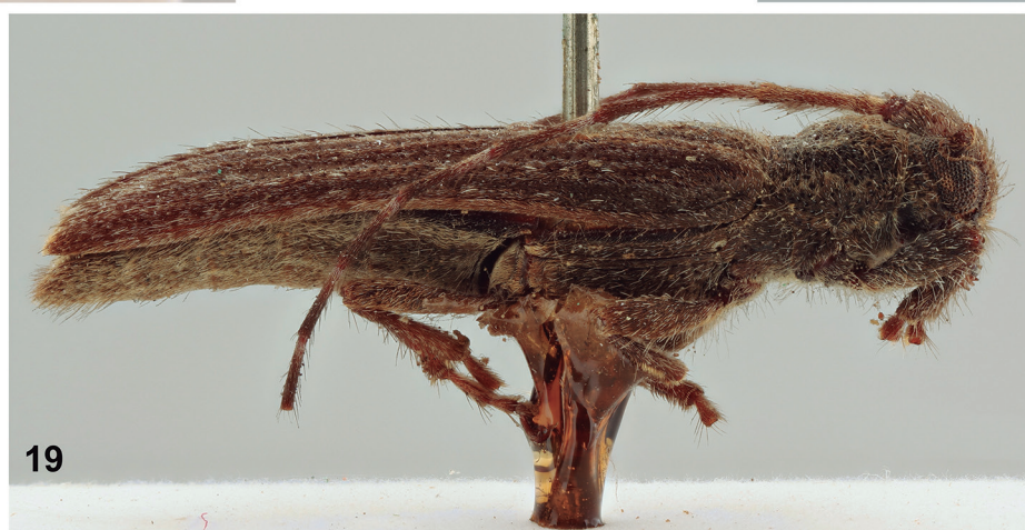
Figures 17-20. (17-19) Epectasis mexicana , holotype male: (17) Dorsal habitus; (18) Labels; (19) Lateral habitus. (20) Chorenta biramiquelus , female, dorsal habitus.