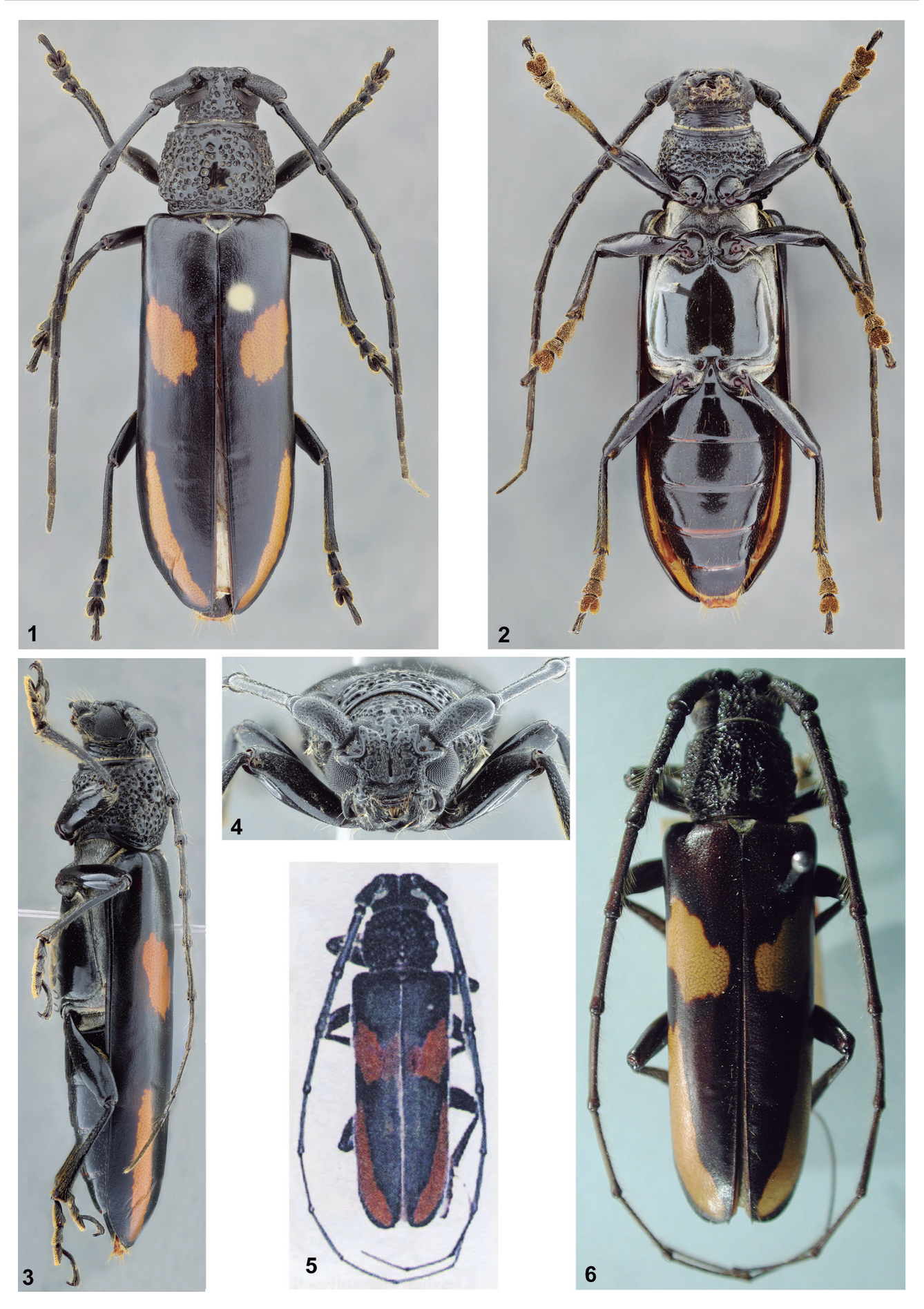
Figures 1-6. Poeciloxestiaplagiata: (1) Dorsal habitus, female; (2) Ventral habitus, female; (3) Lateral habitus, female; (4) Head, frontal view, female; (5) Holotype male, dorsal habitus; (6) Holotype male.