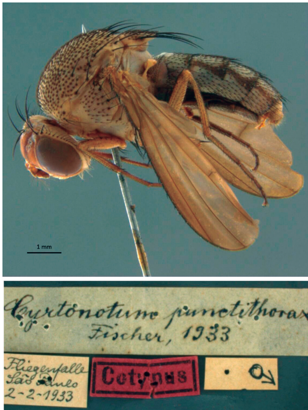
Figure 1. Curtonotum punctithorax (Fischer, 1933), lectotype male herein designated. (A) Habitus, lateral view; (B) Labels.