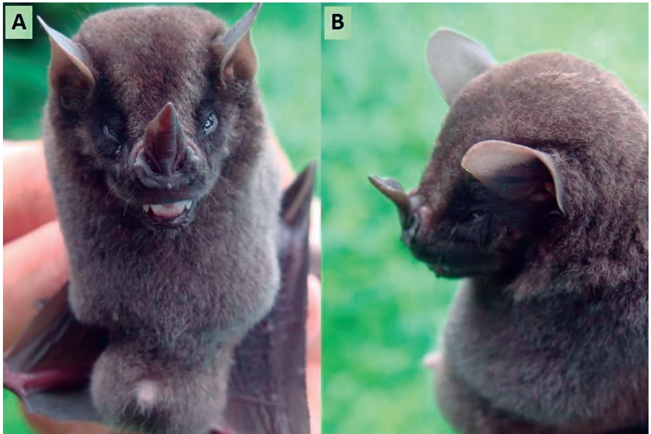
Figure 1. Frontal (A) and lateral (B) views of a live specimen of Platyrrhinus chocoensis collected by WEPR and RAB in San Antonio Farm (voucher number MIZI2012397).

(Table 1). Based on the P. chocoensis vouchers deposited in MECN, QCAZ, TTU, and on our record, we propose that the new species distribution extends to Santo Domingo de los Tsáchilas province (Fig. 2). Furthermore, according to Burneo & Tirira (2014), it may extend to the Los Rios Province and may reach the lowland moist forests of the Los Guayas Province, considering the similar ecological characteristics of these forests.