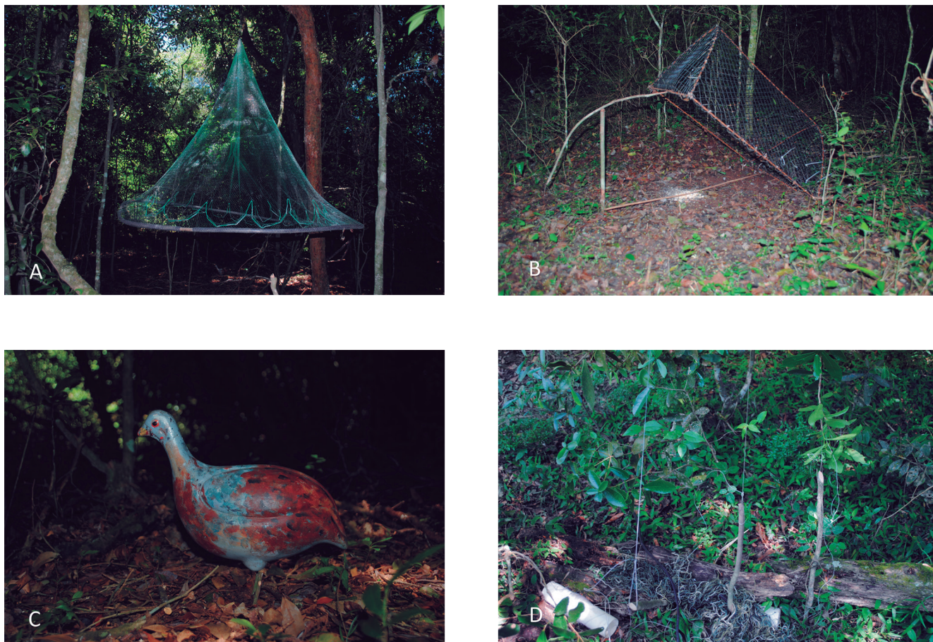
Figure 2. Bell-trap: (A) Plastic hose keeping the trap open. (B) Pyramid fall-trap with automatic trigger and cereal baits. (C) Tinamou ceramic replica. (D) Wooden stakes fixed on the ground, holding the nylon line which lifts the bell-trap.

After being captured, individuals were marked with metal bird rings provided by the National Center of Research and Conservation of Wild Birds (CEMAVE). As this species does not present apparent sexual dimor-