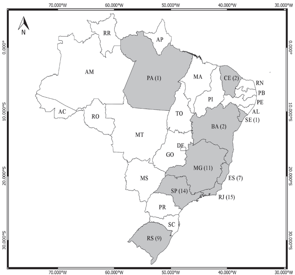
FIGURE 2: Distribution of the number of Asphondylia species (Diptera, Cecidomyiidae) per Brazilian states. Legends: AC: Acre; AM: Amazonas; AP: Amapá; MA: Maranhão; AL: Alagoas; BA: Bahia; CE: Ceará; PB: Paraíba; TO: Tocantins; PA: Pará; RO: Roraima; PE: Pernambuco; PI: Piauí; RN: Rio Grande do Norte; SE: Sergipe; DF: Distrito Federal; GO: Goiás; MT: Mato Grosso; MS: Mato Grosso do Sul; ES: Espírito Santo; MG: Minas Gerais; RJ: Rio de Janeiro; SP: São Paulo; PR: Paraná; SC: Santa Catarina and RS: Rio Grande do Sul.

The genus was found in five biomes, Atlantic forest, Cerrado, Caatinga, Pampa, and Amazonian forest (Fig. 1). The gall midges were found mainly in restingas (18 spp.), the most surveyed physiognomy of the Atlantic forest. As the restingas comprise several multivoltine gall midges, specimens are more easily