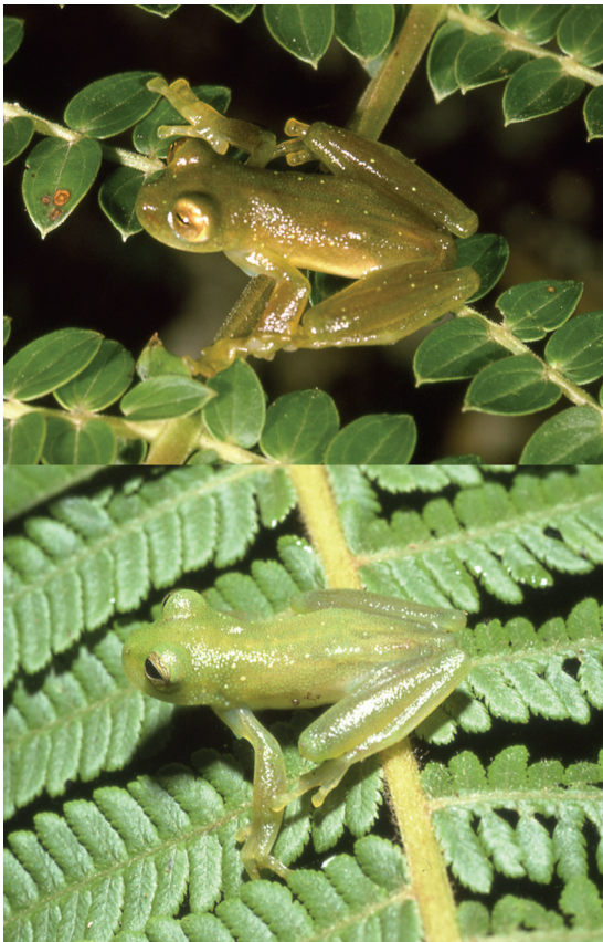
FIGURE 1: Photographs of Centrolene audax : (A) KU 164500 from 2 km SSW of Río Reventador, Napo, Ecuador; (B) KU 211770, holotype of Centrolene fernandoi , from W slope of Abra Tangarana, San Martín, Peru.

differences used to separate them are intraspecifically variable within C. audax . Snout form of C. audax varies between rounded to truncate in profile, presence of spicules shows sexual and ontogenic variation (visible in reproductive males, and absent in non-reproductive males and females), dorsal flecks vary from pale yellow to golden yellow (furthermore, the photograph of C. fernandoi in the original description shows pale yellow spots), finger colouration varies from pale green to bright yellow, and iris colouration varies from pale bronze to silvery green or mustard with thin black reticulation. Since no discrete differences are evident and their populations have no obvious biogeographic barriers, we place Centrolene fernandoi Duellman & Schulte, 1993 as a junior synonym of Centrolenella audax Lynch & Duellman, 1973. Therefore, Centrolene audax inhabits Low Montane Evergreen Forest on the Amazonian versant of the Andes of southern Colombia, Ecuador, and northern Peru, between 1080 and 1800 m (Duellman & Schulte, 1993; Mueses-Cisneros, 2005; Cisneros-Heredia & McDiarmid, 2007; Yáñez-Muñoz et al. , 2010).