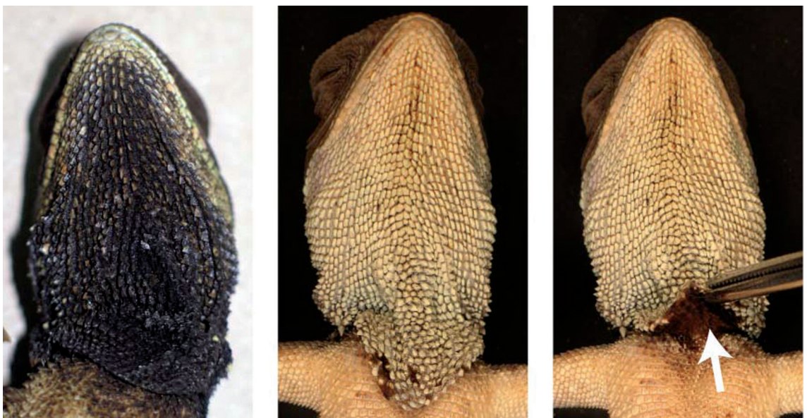
FIGURE 4: Gular región of adult males of E. touzeti sp. nov. (EPN 10306; and E. oshaughnessyi (USNM 285457; center, right). White arrow indicates black patch on gular fold in E. oshaughnessyi (right).

E. heterolepis differs from E. oshaughnessyi and E. touzeti sp. nov. by having small scales on the dorsal aspect of body and limbs intermixed with large conical scales, a less pronounced vertebral crest, smooth ventrals, and a strongly laterally compressed tail. The new species differs from E. oshaughnessyi by having the body flanks conspicuously folded (lateral folds absent or inconspicuous in E. oshaughnessyi ; Fig. 2), small paravertebral scales, each with a conspicuous medial keel (larger and smooth or slightly keeled paravertebrals in E. oshaughnessyi ); scales on body flanks homogeneous in size (a few non-conical, scattered enlarged scales might be present on flanks in E. oshaughnessyi ); less subdigitals on Finger IV (16-19 and 18-24, respectively; t -test, t = 3.880 , P < 0.005 ); less ventrals on a transverse line at midbody (23-32 and 26-37, respectively; t -test, t = 3.179 , P < 0.005 ); less transverse rows of ventrals between fore and hind