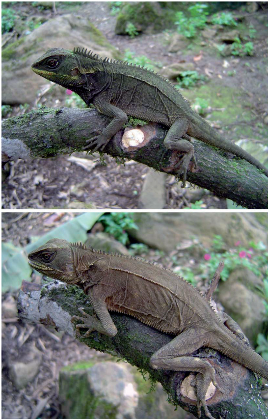
FIGURE 1: Adult male (top; holotype, EPN 10306) and female (bottom; paratype, EPN 10307) of Enyalioides touzeti sp. nov.

Limb scales strongly keeled; scales on dorsal and posterior aspects of thighs less than half the size of those scales on anterior and ventral aspects; subdigitals on left and right Finger IV 17 and 16, respectively; subdigitals on left and right Toe IV 21 and 22, respectively; one femoral pore on each side; tail lat-