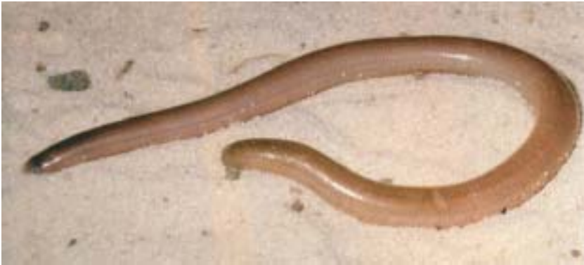
Figure 2. Typhlops amoipira (MZUSP 12299, paratype) from Ibiraba, State of Bahia, Brazil.