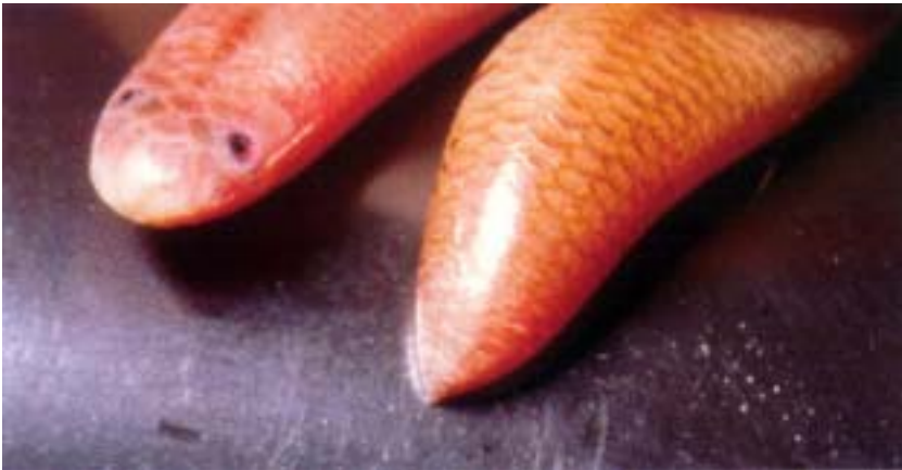
Figure 3. Typhlops amoipira (MZUSP 12299, paratype) from Ibiraba, State of Bahia, Brazil.

rostral, preocular, first and second supralabials, and frontal. Nasal wider than frontal and wider at nostril level, narrower posteriorly. Nostril in the posterior part of nasal, at the level of inferior part of ocular. Nasal suture incomplete, occupying the inferior third of nasal and coincident with suture between first and second labials. Frontal as long as large, cicloid, contacting rostral and preventing midline contact between nasals. Following frontal two imbricate and cicloid scales, the first identical to frontal in size and shape, the second wider. A pair of longer than wide distinctive supraoculars, diagonally oriented, minimally separated by frontal at midline. Supraocular covers the superior part of ocular; anterior part of supraocular imbricates under part of frontal, nasal, and preocular. Preocular large, wider at nostril level, contacting second and third supralabials, covering anterior part of ocular and supraocular, and reaching the