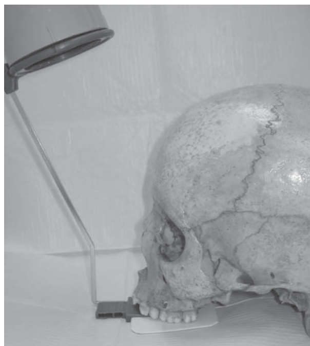
Figure 1- Occlusal x-ray film holder and skull positioned for standardized occlusal radiograph

A total of 27 randomized occlusal radiographs were obtained using insight IO-41 film (size 5.7 cm x 7.6 cm; KODAK) with 1.5 s exposure time at 10 mA and 70 kV. The occlusal radiographs were taken with a correct alignment between the cylinder localizer from the x-ray machine and the ring from the occlusal radiographic position self-drilling film. Each operator took the occlusal radiograph for each of the skulls with the occlusal films inserted in the Zanda 20 (2007) film holder and fit the film in more