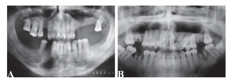
Figure 1- Panoramic radiographs: A, classical cyst aspect as a unilocular radiolucency lesion with well-defined sclerotic margins in a mandible residual cyst; B, maxillary keratocystic odontogenic tumor with unusual bone expansion and tooth displacement

The material from biopsies was processed and stained with H&E. Results from the histological examination of the cell block were compared with the histopathological data of the biopsy, as well with the clinical and radiographic data of the lesions. The