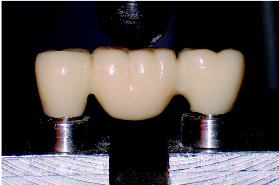
FIGURE 2- Three-unit all-ceramic fixed partial denture