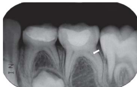
FIGURE 2B- 3-month follow-up periapical radiograph suggesting the initial formation of a dentin bridge immediately below the Portland cement in the distal root (arrow) of the pulpotomized mandibular left second molar and absence of periapical lesion in both pulpotomized mandibular left primary molars