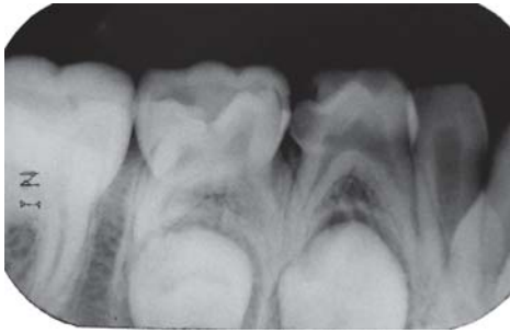
FIGURE 1A- Preoperative periapical radiograph of the mandibular right primary first molar of a 7-year old boy, which presented an extensive caries lesion, more than two thirds of root length and no signs of periapical lesion