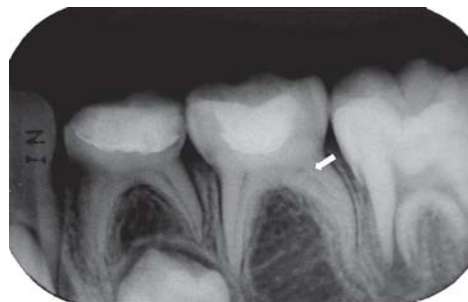
FIGURE 2C- 6-month follow-up periapical radiograph suggesting the presence of the dentin bridge immediately below the Portland cement in the distal root (arrow) of the pulpotomized mandibular left second molar