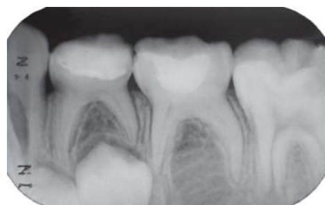
FIGURE 2D- 12-month follow-up periapical radiograph suggesting the initial radicular pulp obliteration of the mandibular right primary first molar