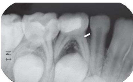
FIGURE 1D- 12-month follow-up periapical radiograph suggesting the presence of the dentin bridge immediately below the Portland cement in the mesial root (arrow) of the pulpotomized mandibular right primary first molar