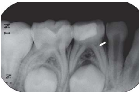
FIGURE 1B- 3-month follow-up periapical radiograph suggesting the initial formation of a dentin bridge immediately below the Portland cement in the mesial root (arrow) and absence of periapical lesion in the pulpotomized mandibular right primary first molar