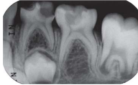
FIGURE 2A- Preoperative periapical radiograph of the mandibular left primary molars of a 6-year old girl, which presented extensive caries lesions, two thirds or more of root length, and no signs of periapical lesion. Agenesis of the mandibular left permanent second premolar was observed