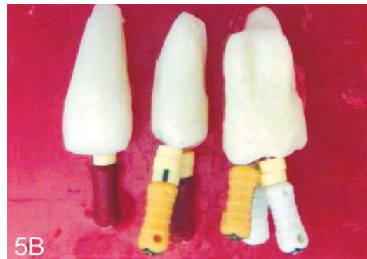
FIGURE 5B- Endodontic files to determine root canal length