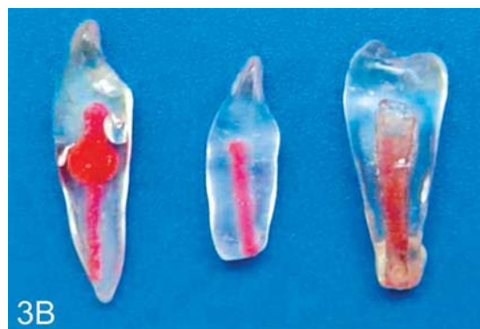
FIGURE 3B- Simulated pulp pathologies: internal resorption, external resorption, and periapical lesion associated with pulp mortification