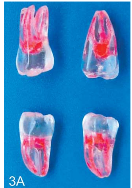
FIGURE 3A- Transparent resin molars