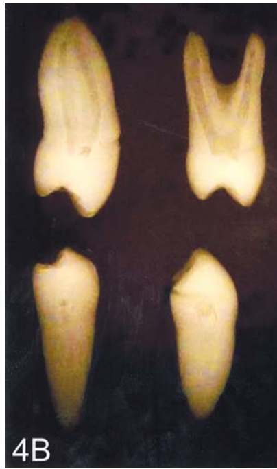
FIGURE 4B- Radiographic image of cloudy resin premolars