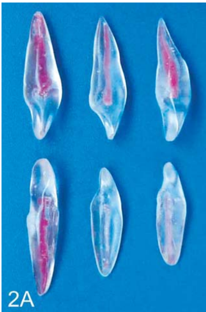
FIGURE 2A- Transparent resin anterior teeth