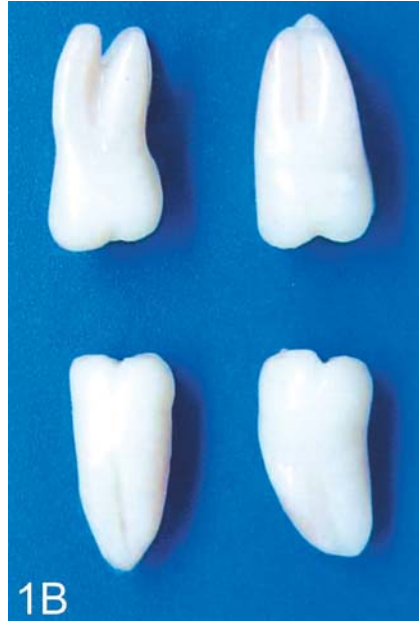
FIGURE 1B- Cloudy resin premolars