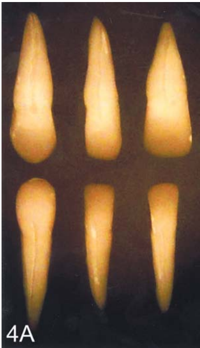
FIGURE 4A- Radiographic image of cloudy resin anterior teeth