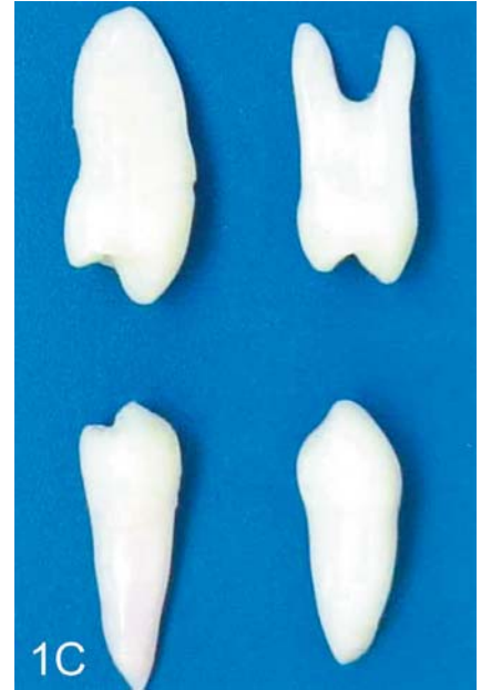
FIGURE 1C- Cloudy resin molars