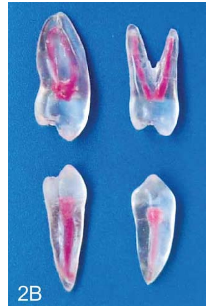
FIGURE 2B- Transparent resin premolars