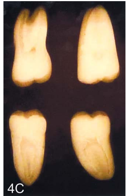
FIGURE 4C- Radiographic image of cloudy resin molars