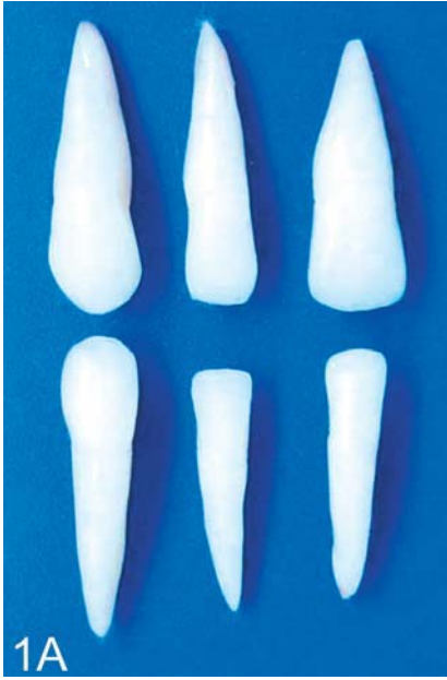
FIGURE 1A- Cloudy resin anterior teeth