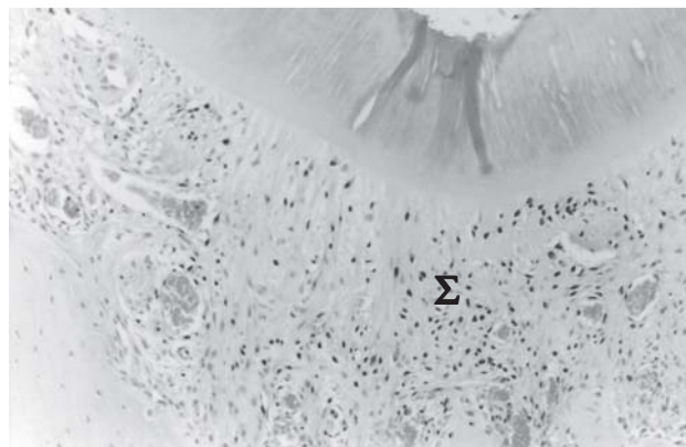
FIGURE 2- Group I, 15 days - dense connective tissue oriented in perpendicular direction to the root surface (Σ)