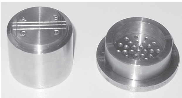
FIGURE 1- Roulette block and tray

The initial reference for all groups was provided by the immediate measurements, called T0 (T zero). All measurements taken at 10 minutes, regardless of the immersion, were called T1. Similarly, those measurements achieved at 20 minutes were called T2. The control group comprised measurements taken from the specimens kept