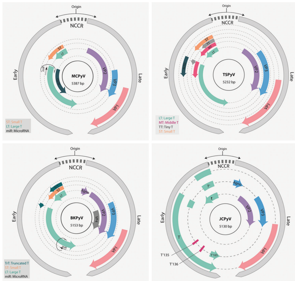
Figure 2 - Schematic representation of the genomes of BKPyV, JCK, MCPyV and TSPyV. The early and late regions (gray) are transcribed from opposite strands of the genome. The early region is transcribed in the counterclockwise direction and harbors the genes coding for the different T antigen isoforms as indicated. The late region expresses the structural genes (VPs) and the agnoprotein ORF (when present). BKPyV, JCV and MCPyV express a microRNA from the opposite strand of the early region. The noncoding control region (NCCR) contains the origin of genome replication and the promoters for the regulation of transcription. For details, see text.

in primary tumors was observed in the derived metastases, supporting the notion that viral integration preceded the clonal expansion of tumor (37).