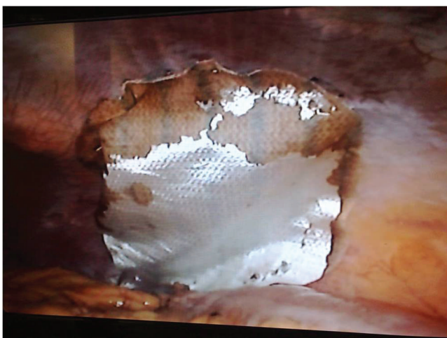
Figure 3 - Non-absorbable polypropylene mesh.