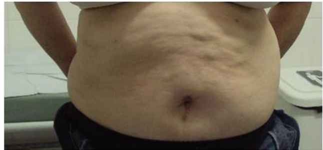
Figure 4 - Aesthetic aspect, six months post-operatively.

A natural progression has led to a reduction in the number of ports required to safely perform a laparoscopic procedure (11). Recently, Desai et al. described their initial 100 LESS procedures. Overall, they described surgical outcomes comparable to those achieved with conventional laparoscopic and open techniques (16). Bucher et al. reported 11 cases of LESS repair of primary and incisional ventral hernias with excellent results (12).