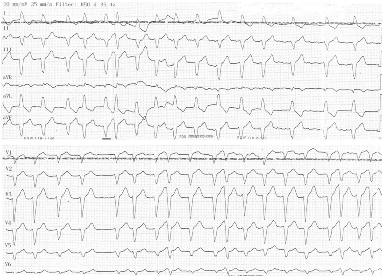
Figure 1 - Paroxysmal atrial fibrillation and intermittent left bundle branch block upon admission.