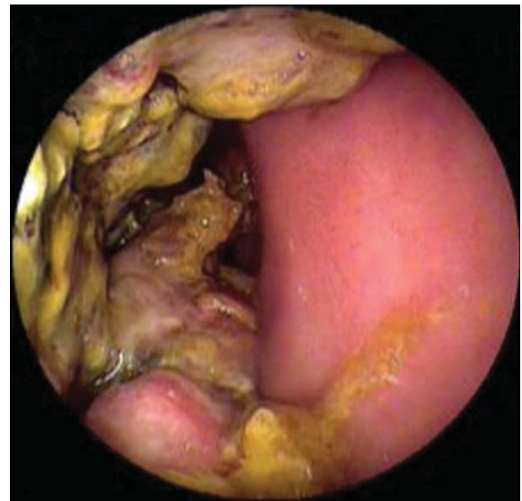
Figure 2. Primary adenocarcinoma of the duodenum