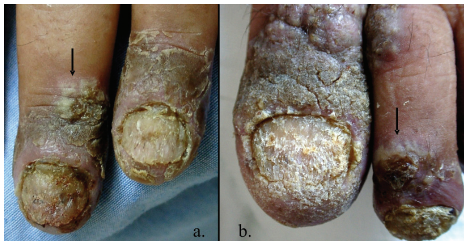
Figure 3 - a. verrucous paronychia with dystrophic finger nail b. similar aspect of the hallux. Note the rest of some flaccid bullae (arrows)