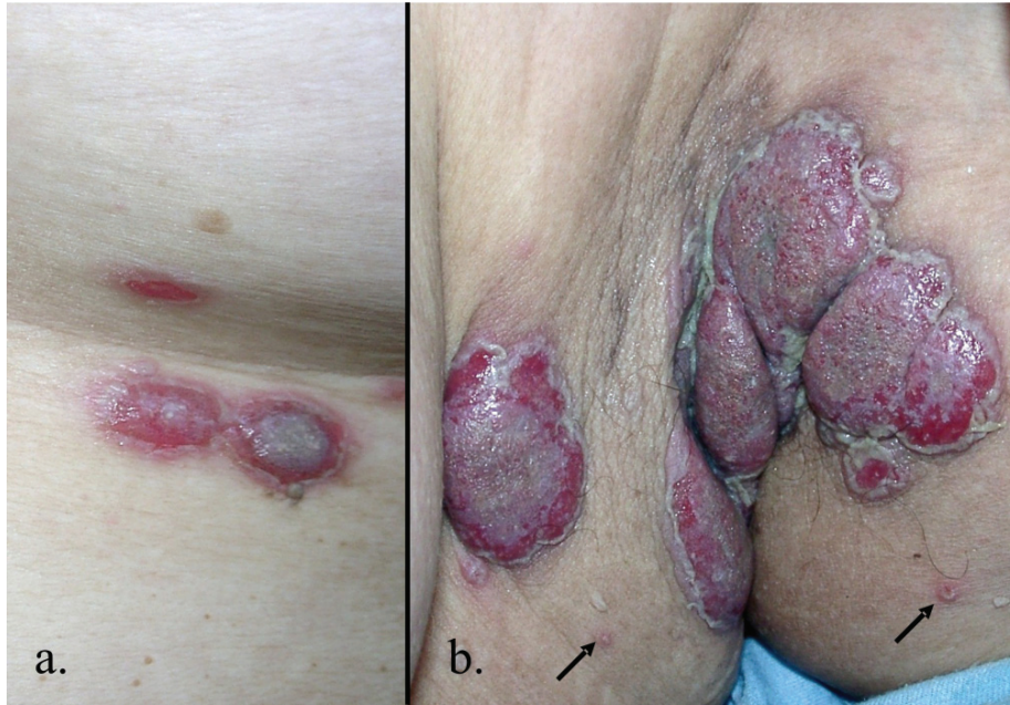
Figure 1 - a. vegetating plaques on the inframammary fold. b. similar lesions in the axillary fold with two small blisters (arrows)