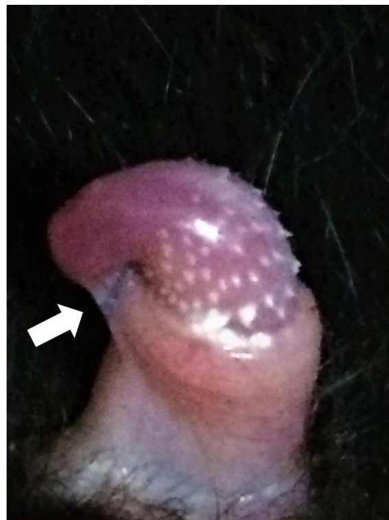
Figure 1 - Macroscopic exam of the penis. Connective tissue attached from the penis to the foreskin along the ventral region of the glans (white arrow).

Only few reports have described penile frenulum in cats, suggesting that this abnormality is uncommon in this species. Moreover, is possible that the factors that may contribute to the low incidence of this reproductive disorder in cats may be related to the lack of attention by owners to observe the disease. Axner et al. (1996) reported a case of dorsal deviation of the penis due to the persistence of penile frenulum in a cat. Similarly, Baran et al. (2014) described a case of an 18-month-old male cat exhibiting penile frenulum associated with phimosis. Both cases were diagnosed during andrological examination and were corrected without complications in outpatient procedures. Furthermore, in this case, the penile frenulum was an incidental finding during andrological examination of cats, such as in the present report. It should be highlighted that the surgical