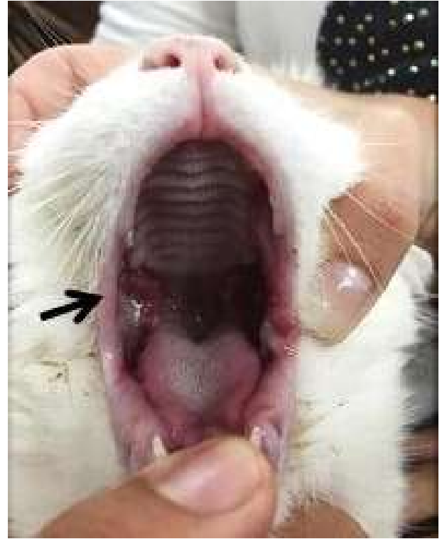
Figure 2 – Recurrence of the lesions in cat with Feline chronic gingivostomatitis