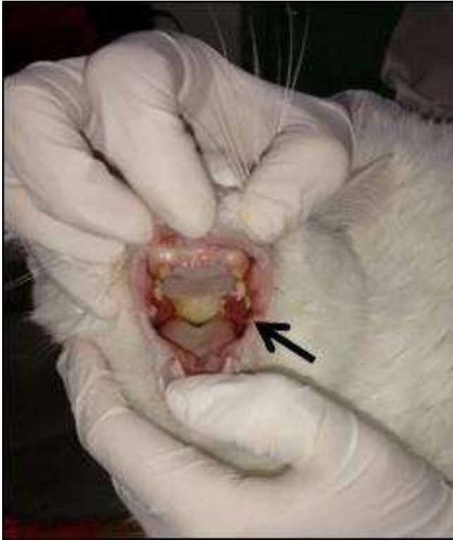
Figure 1 – Presence of ulcers in the oral cavity of a cat with Feline chronic gingivostomatitis

culminating in a better quality of life. Initially, extraction of premolar and molar teeth is chosen, but if there is no satisfactory answer, all teeth are extracted (BELLEI et al., 2008; HOFMANN-APPOLLO et al., 2010; HUNG et al., 2014).