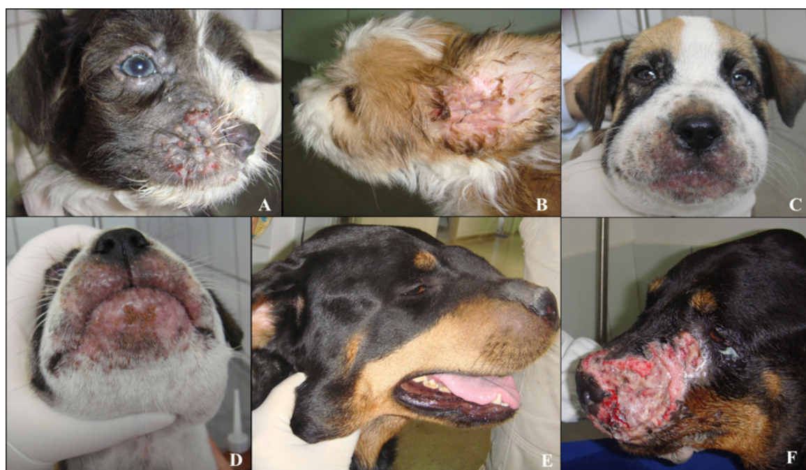
Figure 1 – Clinical signs presented by the dogs with juvenile cellulitis diagnosed at the Veterinary Teaching Hospital at the Universidade Federal Rural do Semi-Árido (UFERSA, Mossoró, Rio Grande do Norte, Brazil) from 2009 to 2016. A: Papules and pustules on the lips and periocular alopecia; B: Otitis externa; C: Facial swelling; D: Swelling, erythema, and meliceric crusts on lips and chin; E: Nasal swelling and submandibular lymphadenomegaly in a 38-week patient; F: Evolution of figure 1E to skin ulceration