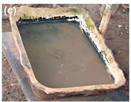
Figure 1 – Examples of (a) clean – clean water and clean container at the moment of inspection, (b) partly dirty – clean water and dirty container at the moment of inspection, and (c) dirty – dirty water and dirty container at the moment of inspection - classifications as nutritional indicators in the protocol for expert report on animal welfare as support for court decisions in cases of suspected animal cruelty