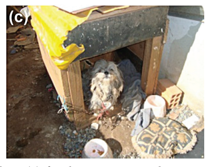
Figure 6 – Examples of space available to the animal for natural behavior, such as (a) freedom to move and express many natural behaviors, (b) moderate restriction by long rope, and (c) severe restriction by short chain as behavioral indicators in the protocol for expert report on animal welfare as support for court decisions in cases of suspected animal cruelty