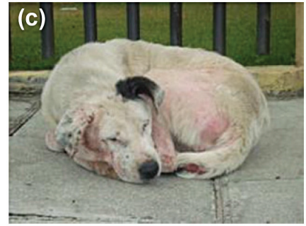
Figure 5 – Examples of potential signs of (a) pain, with hunched back, (b) malaise or apathy, and (c) ectoparasites, e.g Sarcoptes scabiei , as health indicators in the protocol for expert report on animal welfare as support for court decisions in cases of suspected animal cruelty