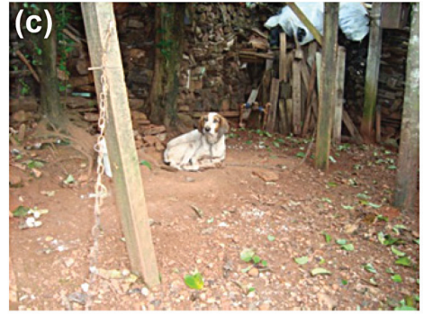
Figure 2 – Examples of (a) adequate shelter, (b) inadequate shelter, and (c) shelter absence, to be evaluated for the assessment of comfort indicators in the protocol for expert report on animal welfare as support for court decisions in cases of suspected animal cruelty