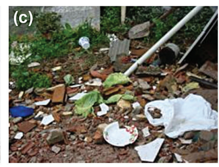
Figure 3 – Examples of (a) presence and (b) absence of comfortable surface for lying, and (c) overall substrate contact surface adequacy and cleanliness as comfort indicators in the protocol for expert report on animal welfare as support for court decisions in cases of suspected animal cruelty