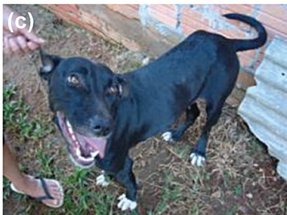
Figure 7 – Examples of animal attitude, such as (a) tail position – tail tucked between legs, suggesting fear, (b) head position – low head position suggesting fear, and (c) overall attitude – relaxed and alert animal, suggesting absence of negative feelings – as behavioral indicators in the protocol for expert report on animal welfare as support for court decisions in cases of suspected animal cruelty