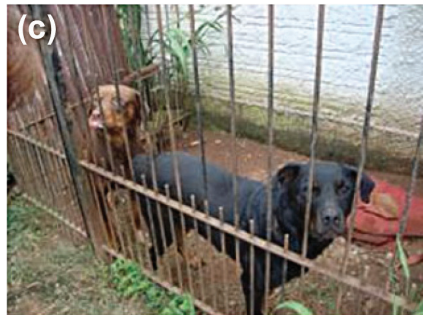
Figure 4 – Examples of locomotion classification as (a) ideal, freedom to move within safe premises, no access to unsupervised areas, (b) moderately restricted by rope, and (c) severely restricted in kennel, as comfort indicators in the protocol for expert report on animal welfare as support for court decisions in cases of suspected animal cruelty