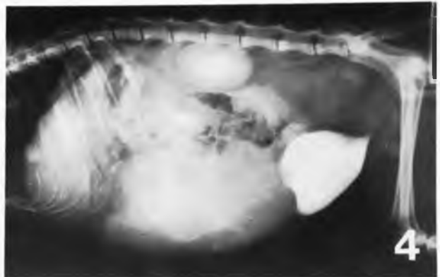
FIGURE 3 - Left lateral view of a cat showing a central abdominal mass with poorly defined margins.