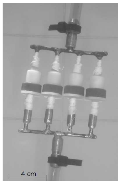
Fig. 1. Metal adaptors with Sep-Paks ® in test pool and in situ allelopathy experiment.

Before the field experiment, the apparatus were previously tested in a pool by using ink to verify the rate of flow of water moving through Sep-Paks ® columns. The substances collecting apparatus were powered by compressed air from a SCUBA tank, whose flow was controlled. A knife was used to cut the colonies inducing an artificial release of chemical compounds in the water following the methods of SCHULTE et al. (1991). The apparatus collected the substances around the species of each replicate during 4-5 hr. The forty Sep-Paks ® columns were activated using MeOH solvent before the field experiment. Each colony sampled used four Sep-Paks ® columns to capture the substances (see Fig.1) which were pooled into a replicate (n=5 replicates) for subsequent analysis. After each sampling the columns were eluted with 60 mL distilled water, 60 mL MeOH and 60 mL DCM. The MeOH extracts were washed with DCM and the DCM extracts were combined. The differences between control and treatment extracts were detected by GC-MS.