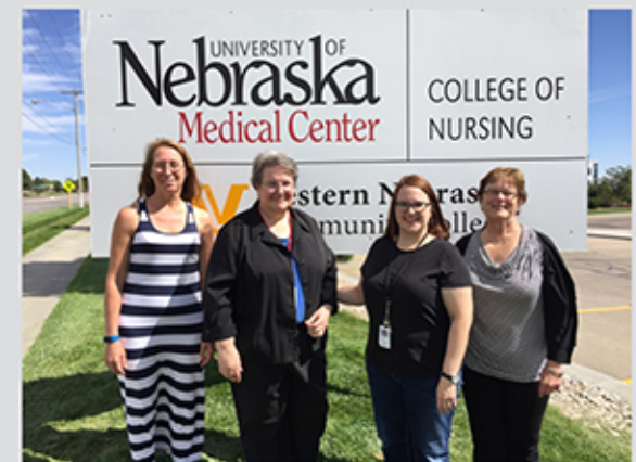
Visiting faculty with on-site professors in Scottsbluff, Nebraska.

Partnership is key between visiting faculty and site-professor by clarifying expectations from both. Support for the visiting faculty member to take part in valued class time. Finally, partnership within the visiting faculty team is key to successful execution of itinerary, class objectives, defining roles, and each member of the team working to their strengths.