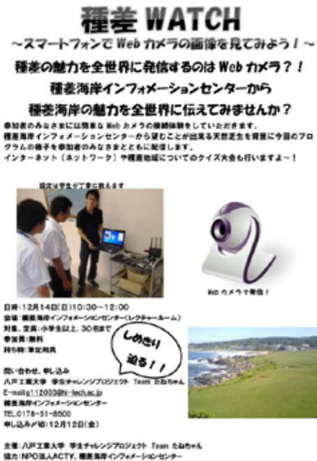
Figure 6 A poster distributed to the city for recruitment of participants (In Japanese)

Prior to holding the event, preparatory work was carried out from 11th to 13th December. As shown in Figures 7 to 8, each member shares their work under the direction of the leader of the student, carefully made preparations of handouts and rehearsals for presentations and quiz meetings.