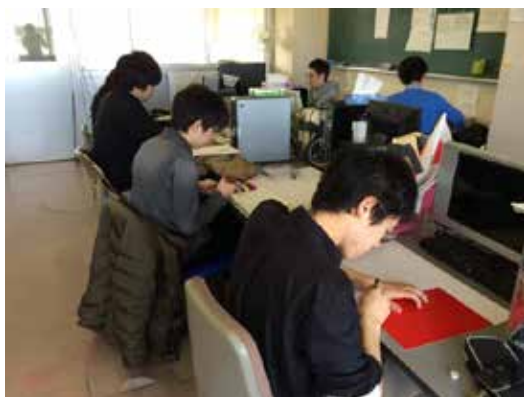
Figure 7 Work scenery in preparation

Prior to holding the event, preparatory work was carried out from 11th to 13th December. As shown in Figures 7 to 8, each member shares their work under the direction of the leader of the student, carefully made preparations of handouts and rehearsals for presentations and quiz meetings.