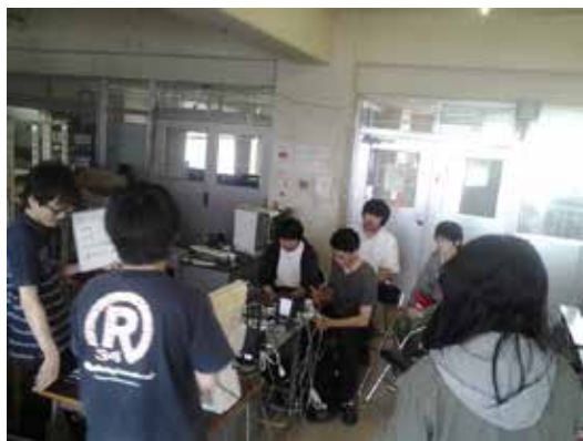
Figure 1 A state of the kick-off meeting

In addition, Figure 1 shows the state of the kick-off meeting, and students are voluntarily conducting activities from the launch of the project to the planning and implementation of the event.