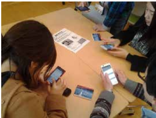
Figure 10 Confirmation of web site by participant's smartphone