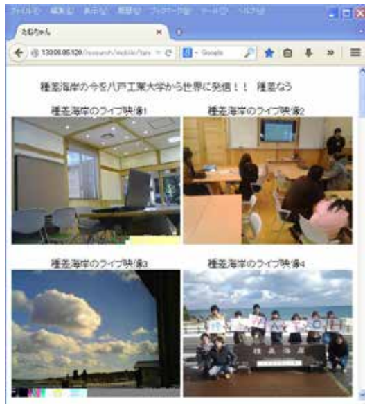
Figure 5 Examples of sending images on the Tanesashi coast (In Japanese)