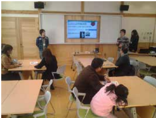
Figure 9 Explanation of the remote monitoring system by students