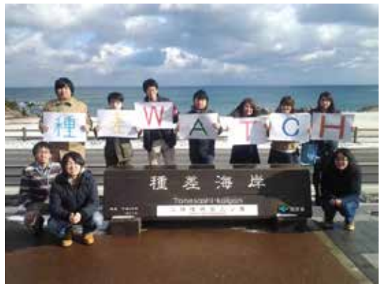
Figure 12 Commemorative photo taken outdoors at Tanesashi Coast