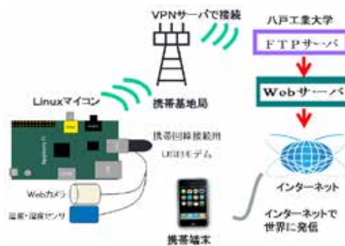
Figure 2 Configuration of a system using Web server that displays sensor information transferred via VPN to FTP server