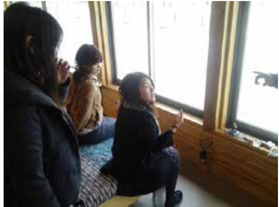
Figure 11 Explanation of installation status of Web camera to participants