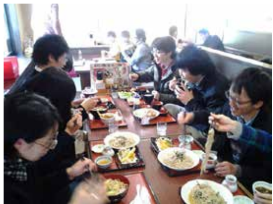
Figure 13 Evaluation meeting after the event

At a later date, student project members reported on details of the work at the outcome meeting. The picture at that