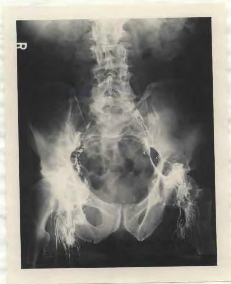
Figure XI - This film was taken immediately after injection and shows a relative void of dye in the right periaortic chain, possible because an insufficient amount of dye was injected. No interpretation of nodes can be made this soon after injection. The "skip area" in the left external iliac region is probably due to the oblique angle of the pelvis.