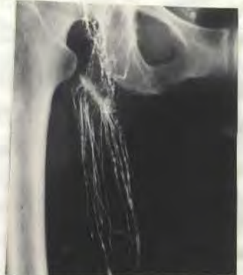
Figure I - Medial afferent lymphatics entering the superficial inguinal complex. Note the "beading" at the valve sites.

27 From here a three way current passes proximally through the external and common iliac regions, giving off side chains to the hypogastric group of nodes. These three chains then converge to form a single chain at the lowermost juxta-aorta level. Arriving at the receptaculum chyli, the entire