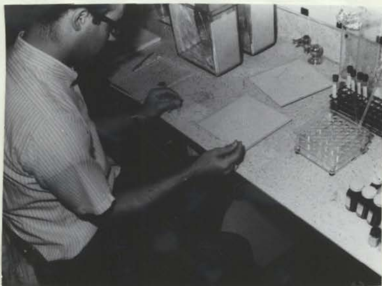
2. Spotting the Plate