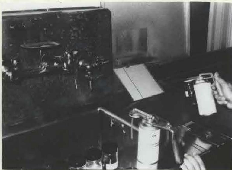
3. Spraying the Plate