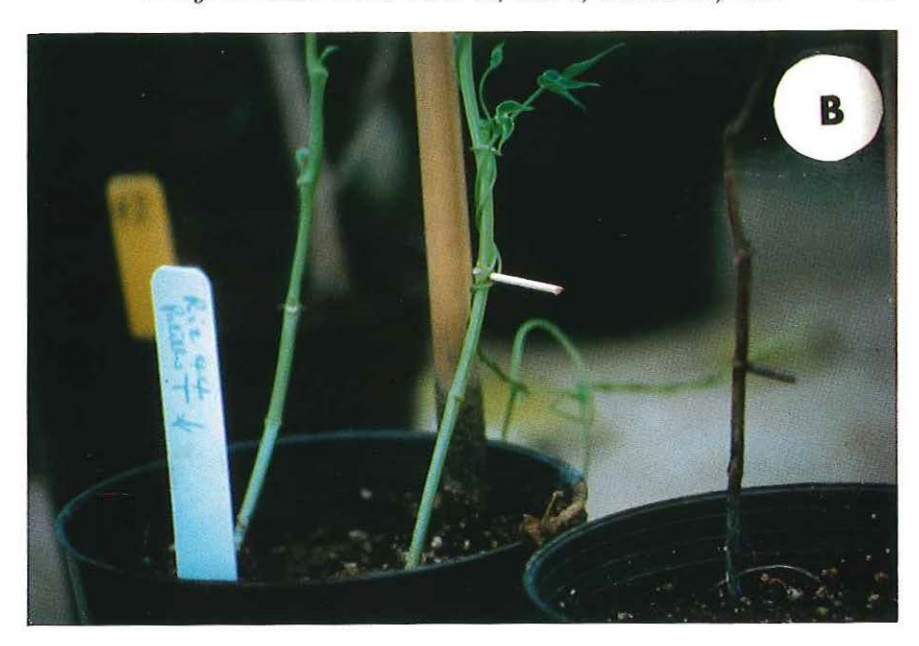
FIG. 2.—Ashy stem blight ( M. phaseolina ) in adult bean plants under artificial inoculation by the toothpick method. RIZ 44 bean variety 30 days after inoculation. Healthy plant (left) and infected plant (right).