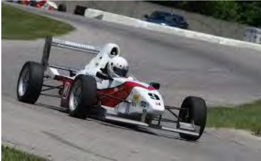
Figure 1.1 open wheel race car