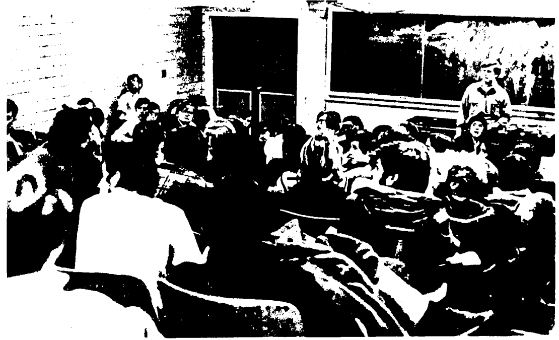
Students met last night in open forum to discuss plans for the March - April Vietnam Moratorium.

"When I decided to run for (continued on page 7)