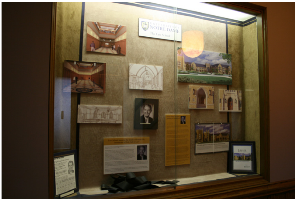
AT LEFT: One of many display cases Beth has designed over the years. This one, detailing the expansion project, stood in the halls of the old law school building prior to the renovation.