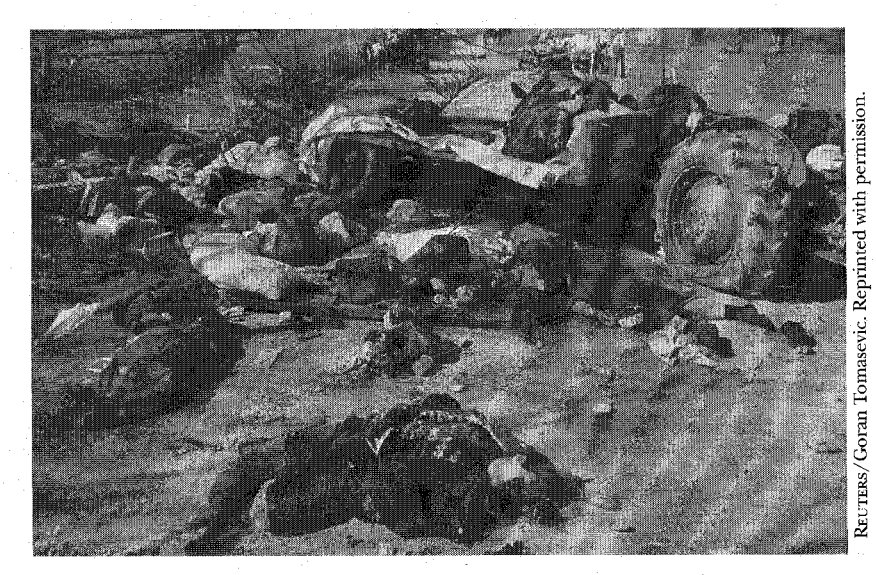
Figure 2—Corpses lie on the road near the Kosovo village of Meja, near Djakovica

personnel carriers at an altitude of 15,000 feet."<sup>21</sup> The irony contained in NATO's explanation is rich: it would seem that when it comes to preventing injustice some innocent lives are worth more than other innocent lives.