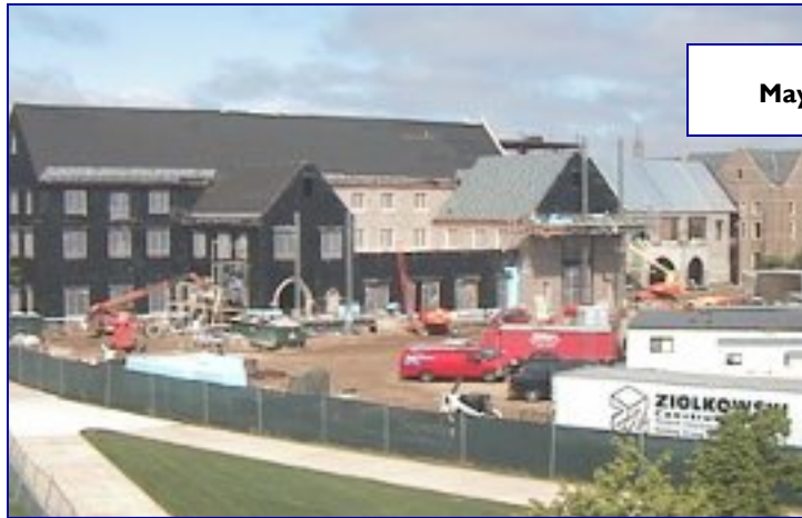
May 12, 2008

AT RIGHT: By spring, much of the exterior had already been finished.