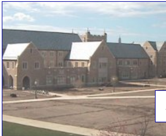
April 15, 2009