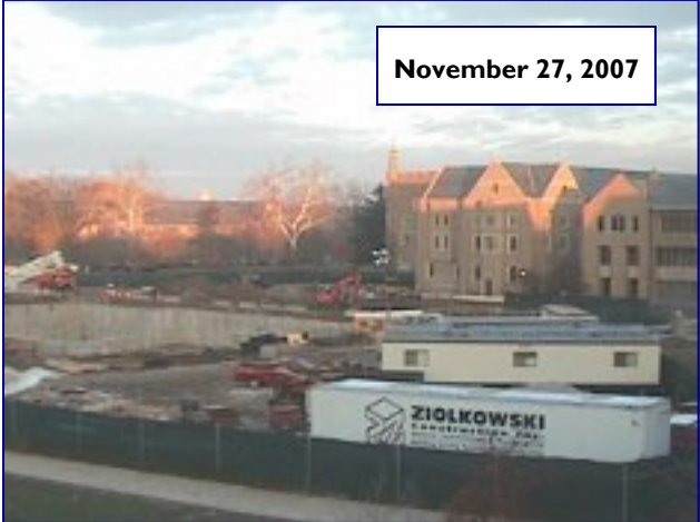
November 27, 2007