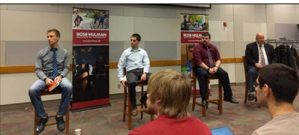
Securing cyberspace is one of the 14 grand challenges for engineering.

The Rose-Hulman community is encouraged to attend the Security League held by Mozilla. The company will be visiting campus on Monday January 30, tenth hour in the GM room to discuss cybersecurity issues.