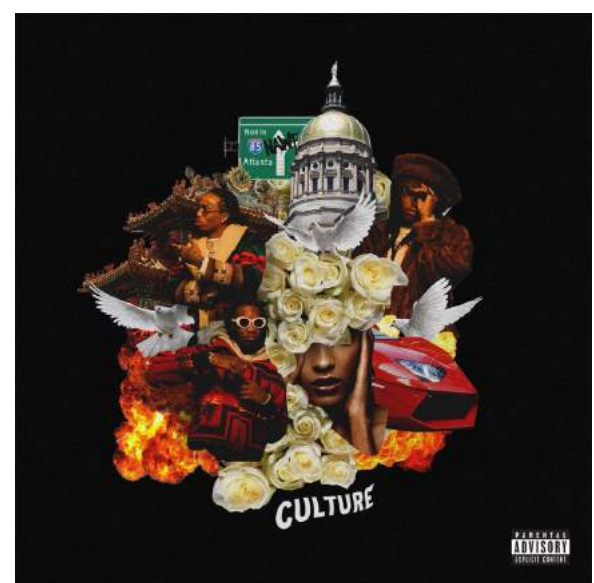
The Cover of C U L T U R E the Migos Newest Album