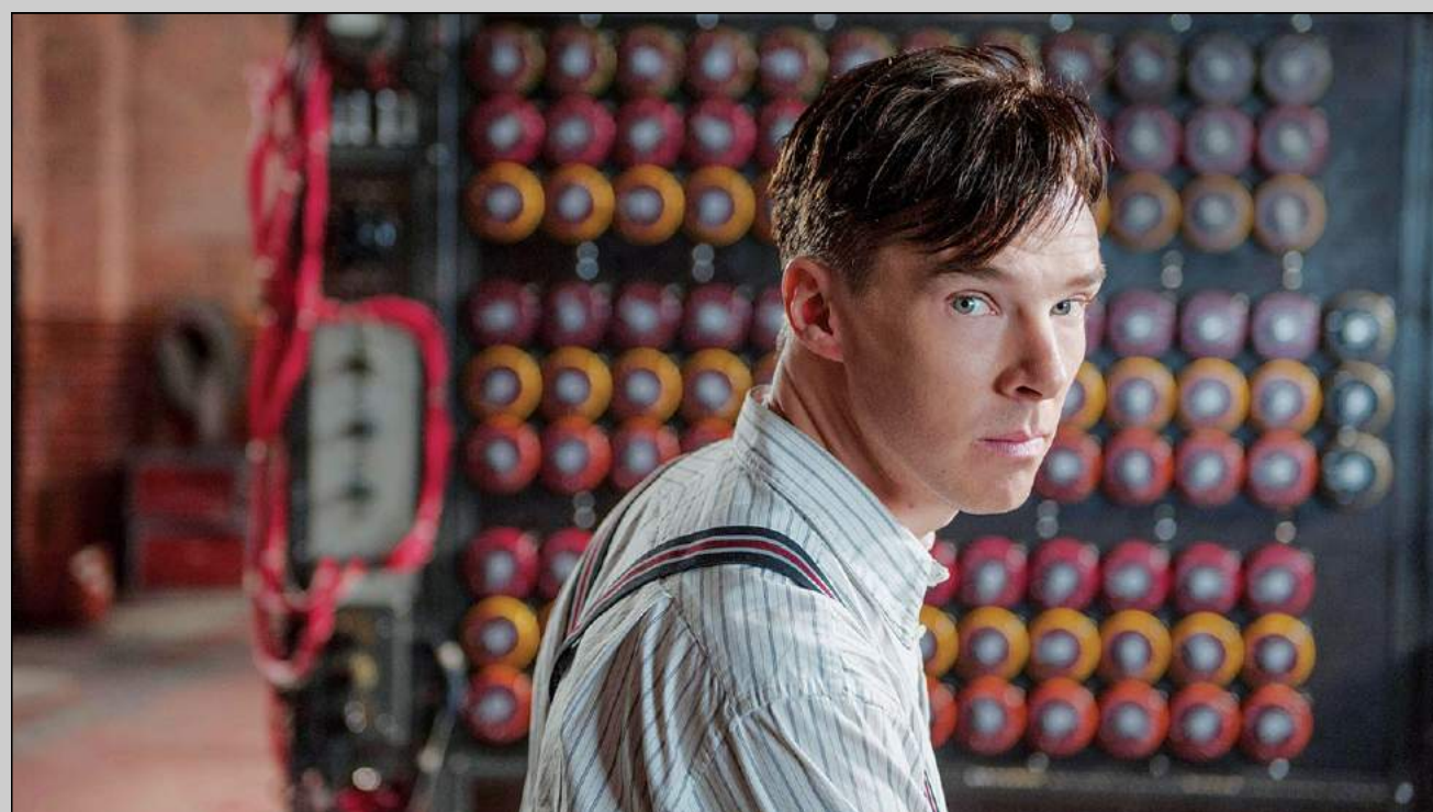
It's a Sherlock, It's a Kahn, It's a Smaug, no It's Alan Turing!

Though the film itself was stunning, the way it handled the grittier aspects of Turing's story revealed the true beauty of Tyldum's