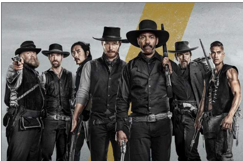
Have lots of guns, will travel.

The plot is pretty much exactly what's described above, but if you are looking for specifics, allow me to paraphrase. There is a Mining baron who wants a town's land, townsfolk don't want to sell, and when he starts shooting pillars of the community (Rest in peace Matt Bomer, your baby blue eyes will be sorely missed), the townsfolk opt to contract some