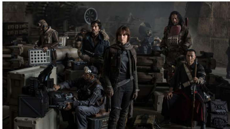
A shot of the cast of Rouge One

The new canon that Disney has created is much smaller new canon than the old “Legends” canon. Right now it is made up of every star wars film, the Star Wars: The Clone war television series and film, the stand-alone comic Star Wars: Darth Maul- Son of Dathomir, and most media composed in collaboration with Lucasfilms Story Group since April 25, 2014. This means that all of the books and videogames that were popular with many star wars fans, including the incredibly popular Star wars: The old Republic game are no longer canon. Do not fret though, avid star wars fans as not all of the “Legends” canon is lost forever, Disney is still selling the “Legends” cannon , just as not officially canon and some parts of the old extended universe is being reapplied to the new cannon that Disney is building. This could mean that as Disney’s plan for the future of Star wars media is