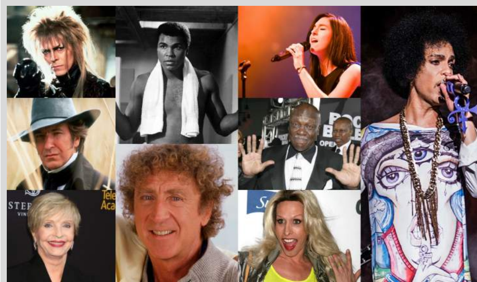
Some of the celebrities 2016 took its toll on. Could have seen it coming.

While the celebrity deaths are incredibly saddening, they are not surprising. 2016 was 46 years away from the beginning of the eighties, when celebrity culture really began in America. Of course, so many celebrities from the eighties who are now at least in their 60's are starting to die. The average life expectancy in America for men is 76.4 and for women is 81.2. The baby boomer generation is starting to hit a higher age and because they make up a larger percentage of the population than past generations did we are going to see the amount of celebrities dying rise in the next couple of years; 2016 was just the first year we noticed the beginning of this trend. It does not help that many eighties celebrities were avid drug users during their time of greatest stardom.