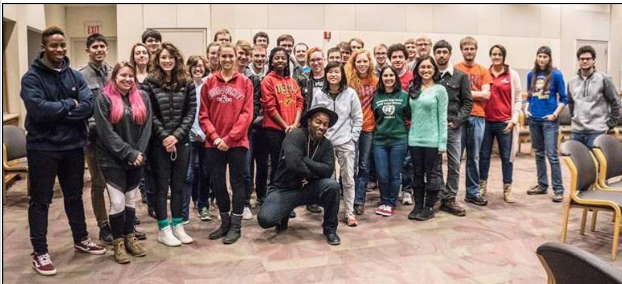
Students from across Rose-Hulman's campus followed the poet himself into the Kahn Room.

In all, I am so happy that I decided to go to his show. I feel that he really provided a perspective into his life all the while brightening our night with jokes and a light mood on this touchy topic. If you get the chance to see him anywhere, in the future I really recommend you see him in the future.